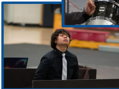
The Varsity Drumline and Percussion Ensemble have been practicing each weekend for their big day! That's VALIANT dedication!