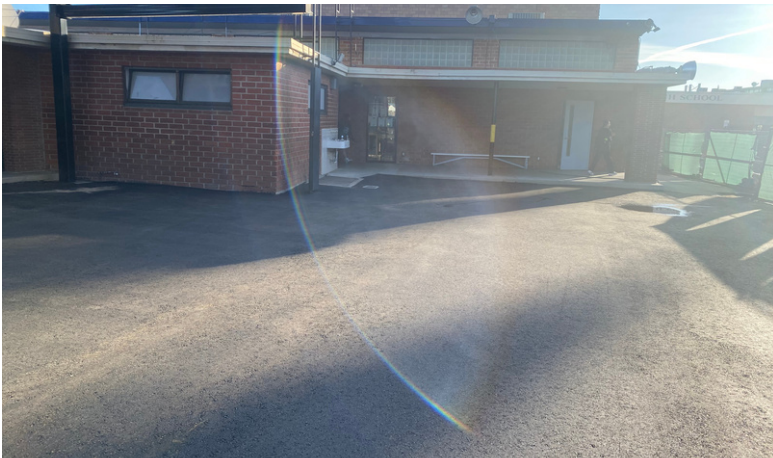
A picture of the new blacktop on the elementary side of campus facing the labs.

Did you move in the last six months? Did you get a new phone number? Have your emergency contacts changed their numbers? If you've answered yes to any of these questions - please call the main office(s) and update your contact information. Having accurate information is important especially should there be any type of emergency.