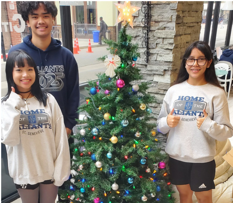
Library is looking good thanks to this team of office practice workers that spruced up the space with a Christmas tree.

Reminder that all students are to be picked up within 20 minutes of dismissal time. In order for a student to be on campus beyond that time, they need to be under the direct supervision of a coach or teacher. The school reserves the right to charge a fee for students who are not picked up within 20 minutes of their dismissal from school or activity.