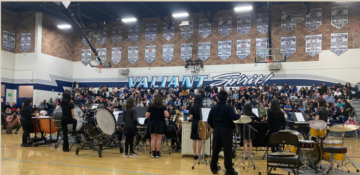
The Band Concerts were a success! Congratulations to all of our musicians in grades 4-12.