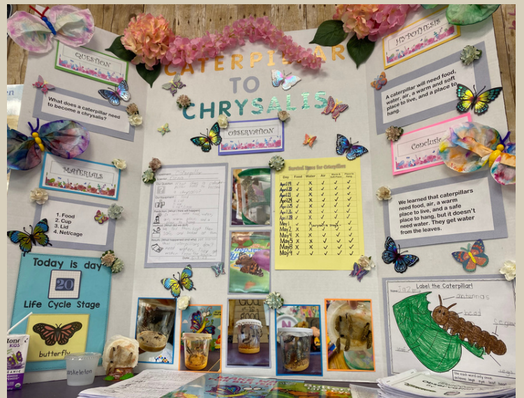
Students also completed Science Projects this week. Students learned how to produce electricity from lemons, how plants grow and got to observe the life cycle of a butterfly.